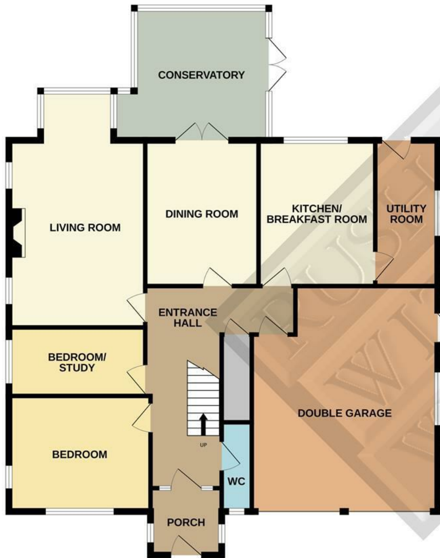
GROUND FLOOR 1397 sq.ft. (129.8 sq.m.) approx.